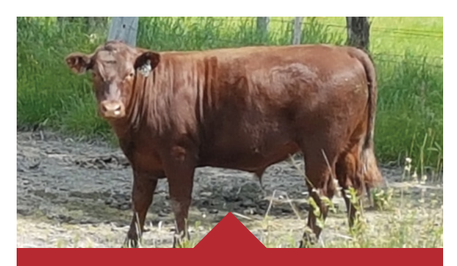
Overall Grand Champion Carcase

On the Hook Lightweight Class One - 1st Place