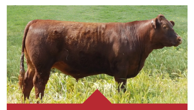
On the Hoof Heavyweight Class 2 - 5th Place

On the Hook Heavyweight Class 2 - 4th Place