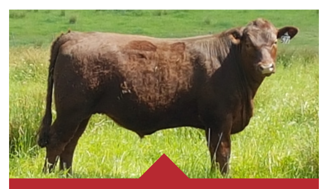
On the Hoof Lightweight Class One - 1st Place

Culminating in Redward being awarded the 2020 Grand Champion Carcase.