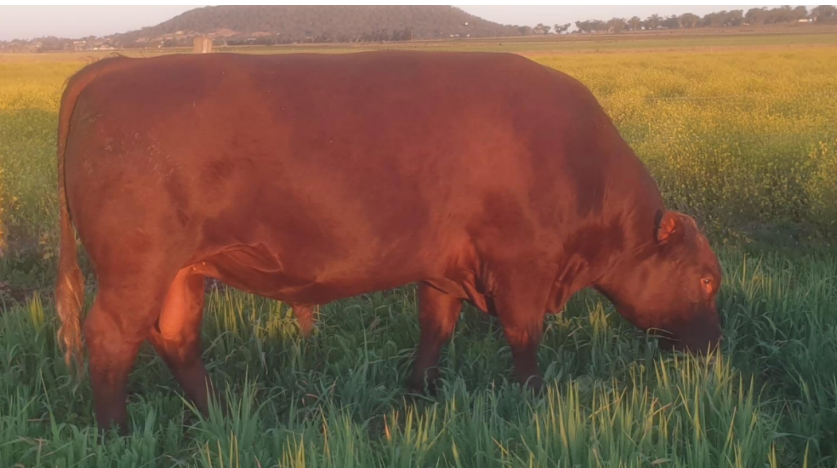
Curley at two year old

Curly is one of the best young sires we have bred and we are excited to see what this bull will do. With 50 calves on the ground across two Studs, Curly is yet to prove himself with his first lot of daughters to calve in March however his calves have been standouts. For two joining seasons Curly was transferred to Toowoomba to the Wilanstie Red Poll Stud where his calves are thriving. Being a son of Amos, he carries exceptional structure, temperament and fine skin and hair type. His depth of heel and leg structure is excellent with perfect teat placement. Despite the sheer capacity and volume that this bull carries he is able to maintain his condition as an easy doing type. Curly's mother was a real 'hard working' type of cow that oozed maternal strength. She was a cow that would typically weigh 630kg but during a tough period of time when she was rearing Curly she pulled herself down to 512kg and weaned the heaviest calf at 330kg at six months old. This meant that in six months she had weaned off 64% of her body weight. He has a scrotal circumference of 43cm and he has tested negative to copies of the myostatin gene.