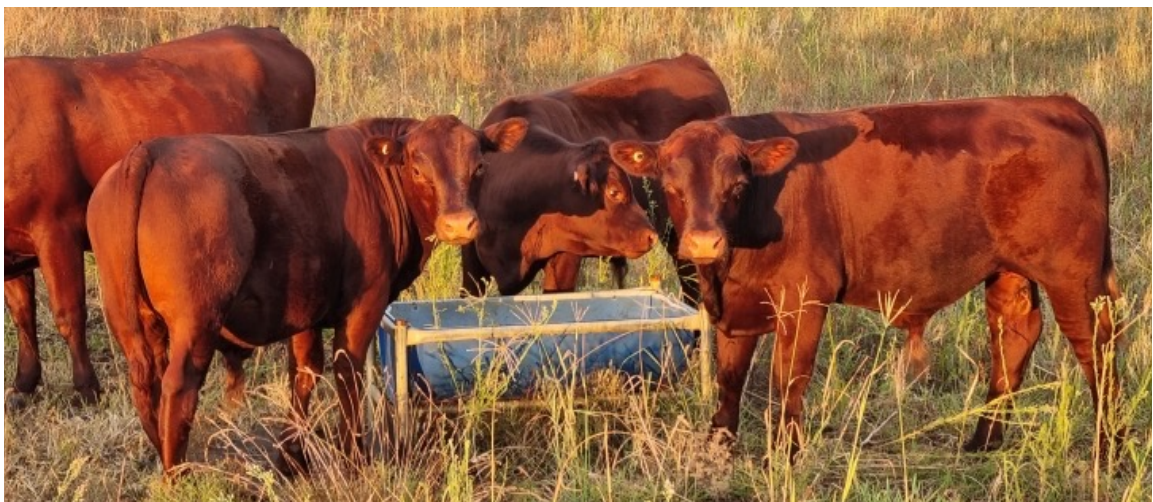
Wilanstie Curly sons at 5 months