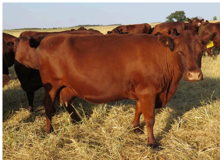
Curley's dam: LOH Z291-3